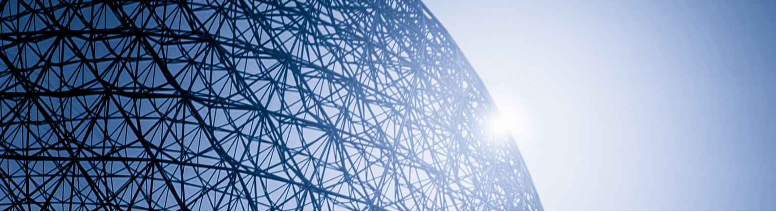
Geodesic Dome, Montreal, R. Buckminster Fuller

Nature builds amazingly robust complex geometric structures. These designs can be used in construction, to structure problems and optimize information flows and communication.